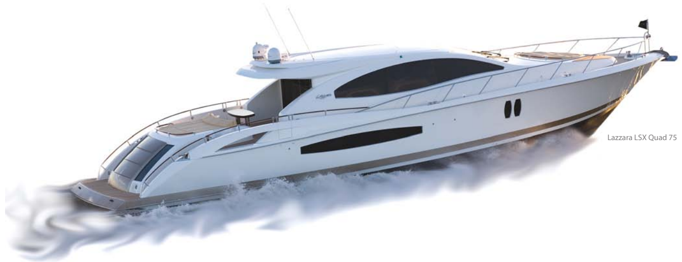
Lazzara LSX Quad 75